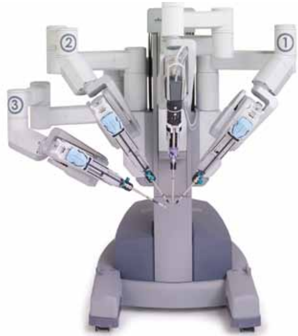
Featured above is the da Vinci Si HD Surgical System Patient Cart

One of the most common treatments for prostate cancer is the surgical removal of the prostate gland, known as radical prostatectomy. The da Vinci Surgical (Robot) is becoming the "gold standard" for this operation.